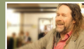
Liam Ó Maonlaí